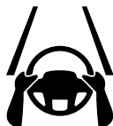
Lane Keeping Assist Enabled/Engaged Indicator

(See Lane Keeping Assist (LKA) Enabled/Engaged on page 10.)